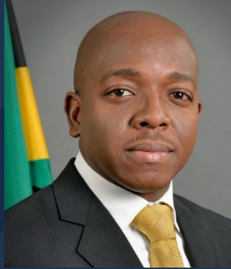
Parnel Charles, Minister of Housing, Urban Renewal, and Environment, Gov't of Jamaica